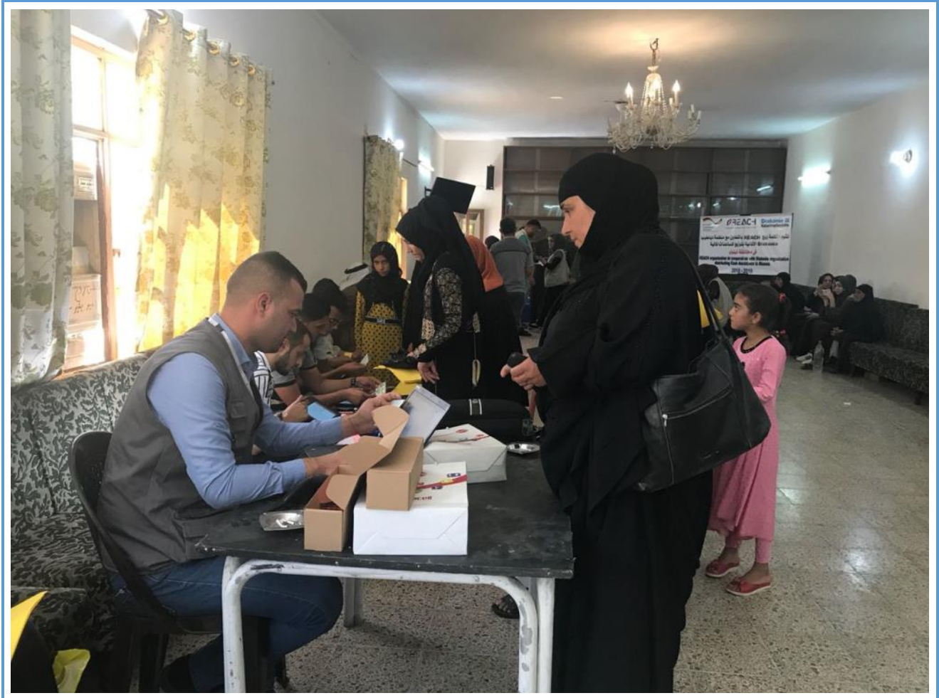
Multipurpose cash assistance distribution for vulnerable families, Mosul

In December, REACH continued to support vulnerable families from West Mosul and Tel Kaif with cash assistance. REACH selected 152 most vulnerable families to distribute multi-purpose cash . The assistance come through hawala system by using mobile money transfer. 152 beneficiaries received sim cards, which help them to receive 400 $ per each family, and spend it on their personal needs.