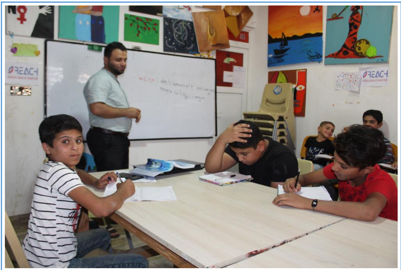
Children during English training in Raparin Community Center, Sulaimaniya