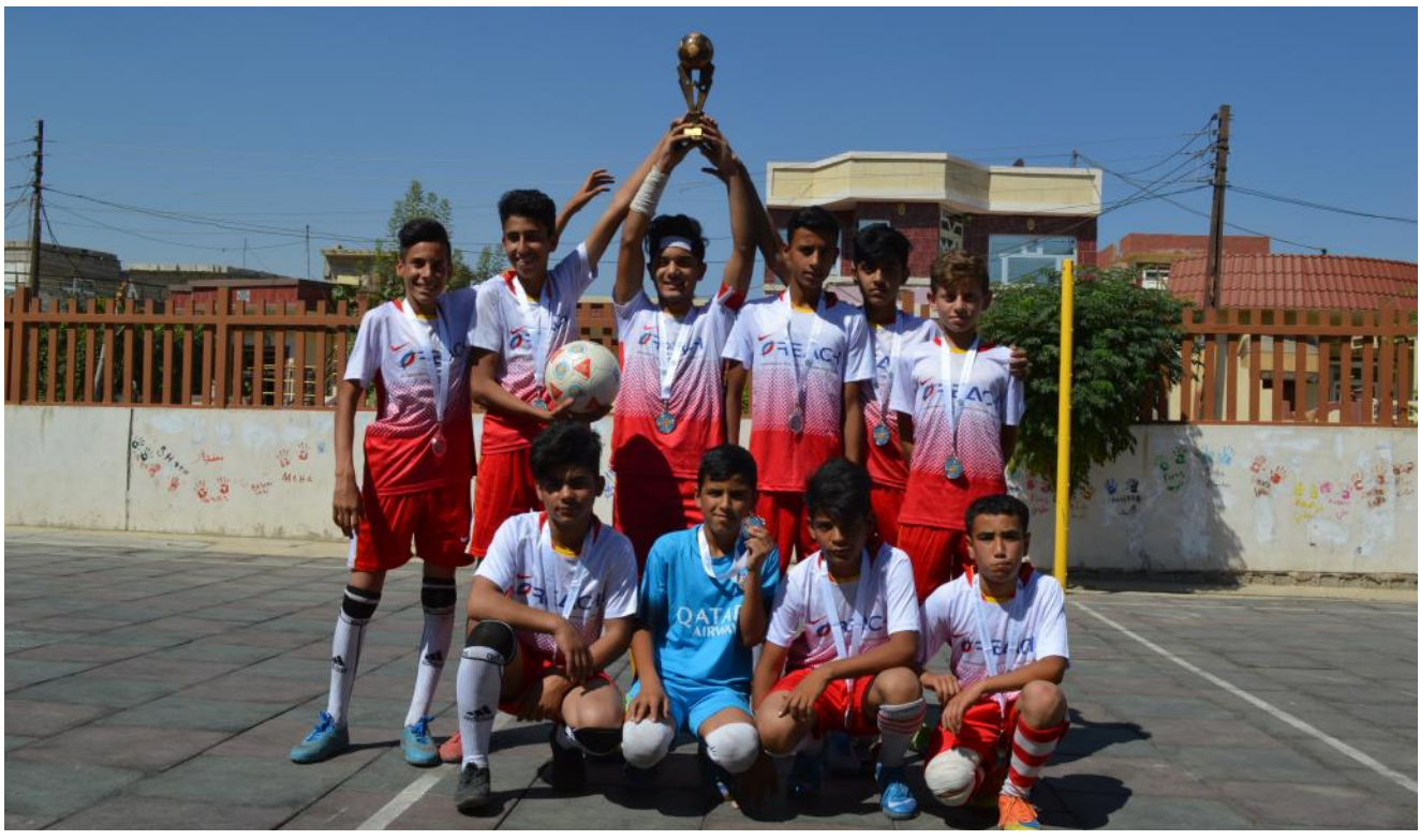
Football match in Baynjan community center, Sulaimaniya

Psycho-social activities of REACH promote a healthy, and active community, build stronger, healthier, happier, and safer communities. Through these activities community's cooperation across societal divisions for their common good will be improved and build social cohesion among the IDPs, Host and Refugees.