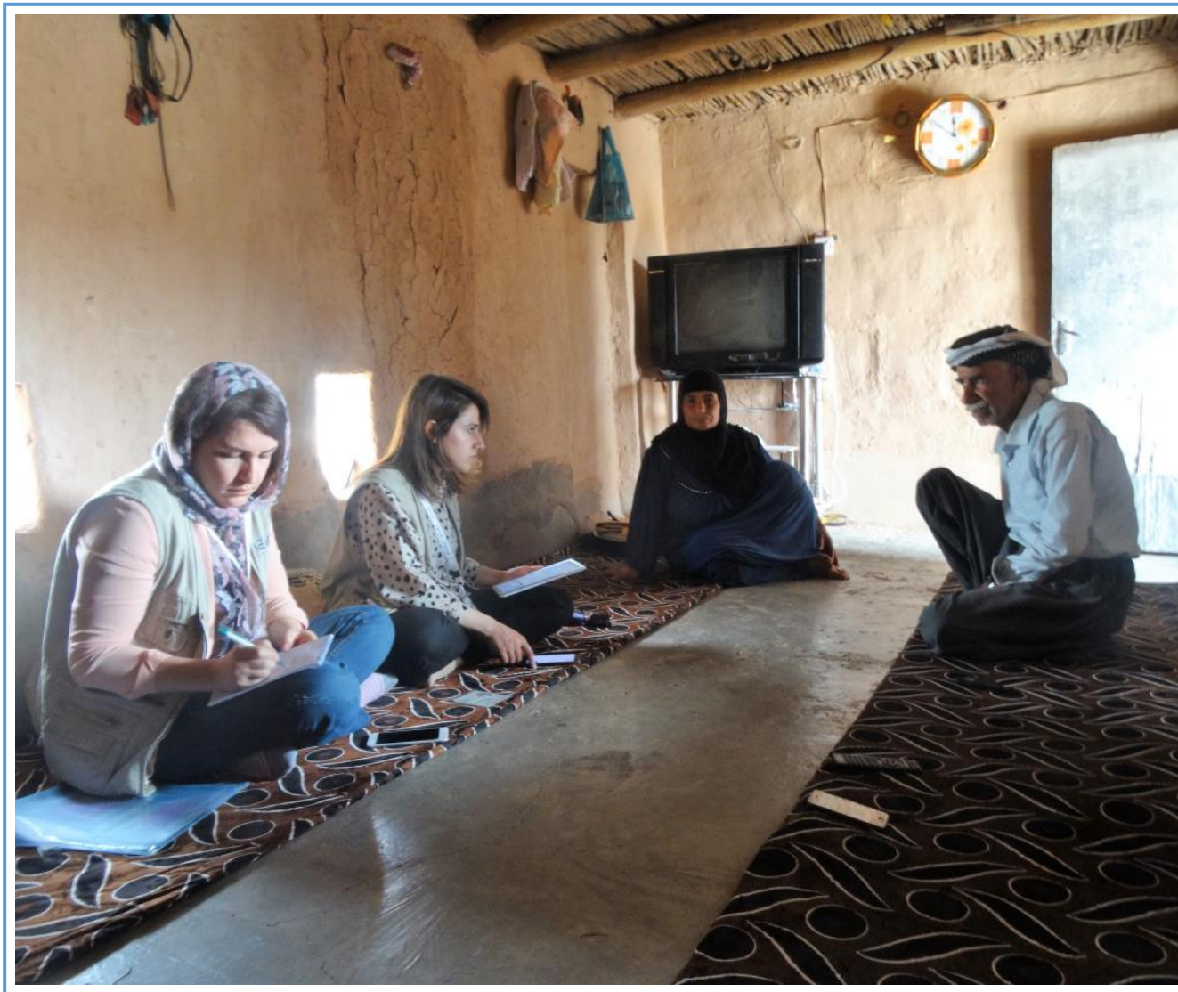
Field monitors conducting final monitoring for kitchen gardens in Masoee bargach village , Sulaimaniya

REACH works on increasing food security in villages of Sulaymaniyah, Iraq.